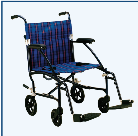
Item # DFL19-BL Shown

It is important for the attendant to be familiar with proper assisting procedures in any situation that requires the use of the Transport Chair. Safety is the Key consideration. Consult your physician, nurse or physical therapist to determine methods most suitable for your individual needs and abilities.